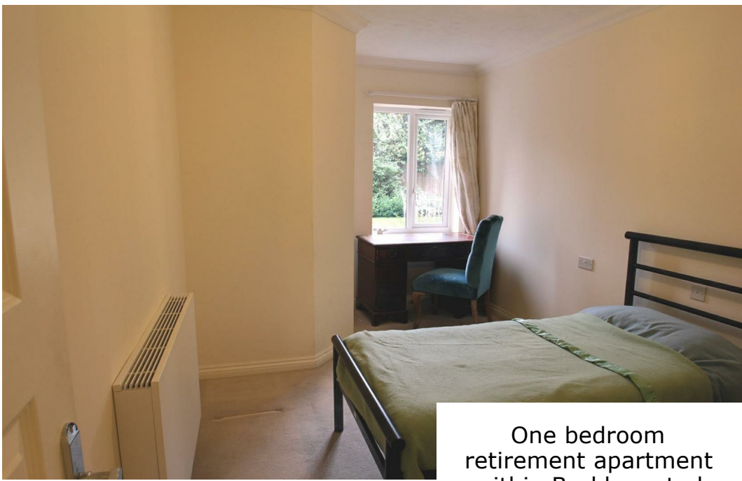
One bedroom retirement apartment within Berkhamsted on a level walk to the high street.